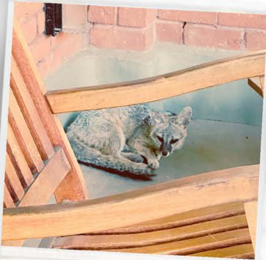
FOX FRIEND ON THE PORCH