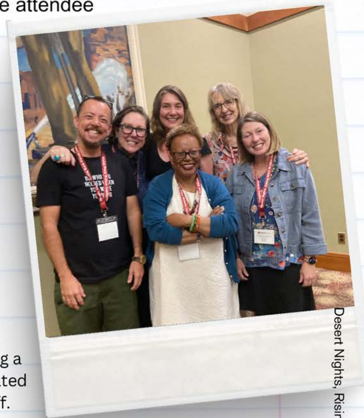
Desert Nights, Rising Stars