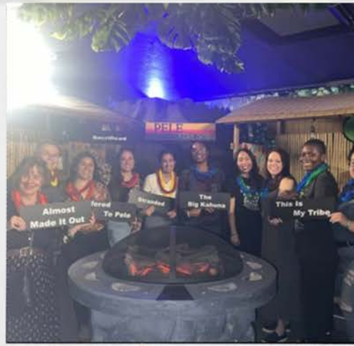
PIPER TEAM BUILDING