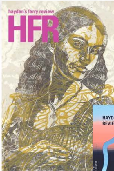
HFR issues 73 and 74