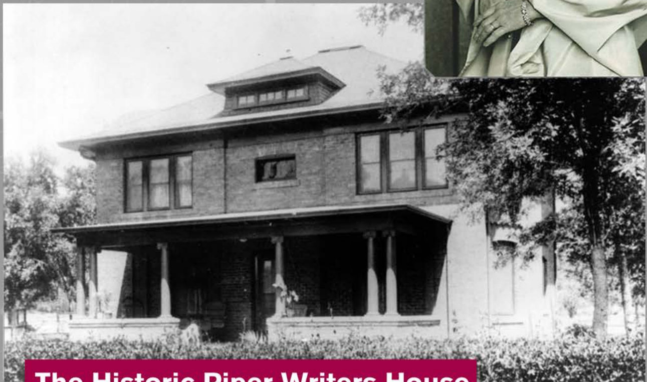
The Historic Piper Writers House